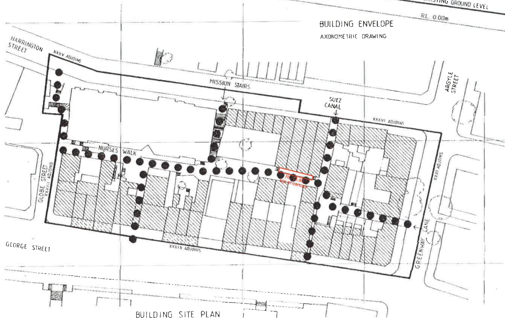
BUILDING SITE PLAN